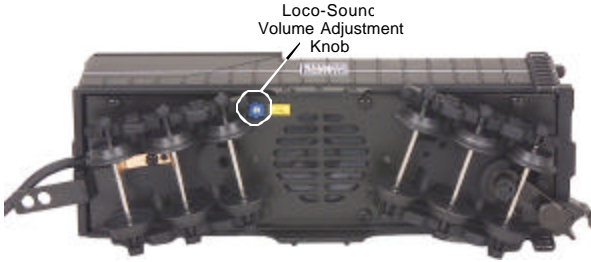
Figure 1. Loco-Sound Volume Adjustment Knob

Volume Control – To adjust the volume of all sounds made by this engine, turn the master volume control knob located under the tender clockwise to increase the volume and counter-clockwise to decrease the volume (see Fig. 1).